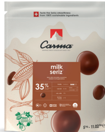
CARMA® Milk Seriz 35% 5 kg • CHM-N025SERIE6-Z72