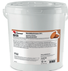
CARMA® Almond Baking Paste 24% 12.5 kg • PWN-AL580BAK24-671