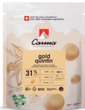
CARMA® Gold Quintin 31% 1.5 kg • CHW-R118GOLDE6-Z71