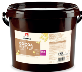
CARMA® Cocoa Butter 3 kg • NCB-HD703-CA-654