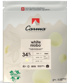
CARMA® White Nibio 34% 5 kg • CHW-O050NIBOE6-Z72