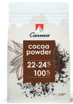
CARMA® Cocoa Powder 22-24% 100% 1 kg • DCP-22H05-CAE6-89B