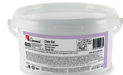
CARMA® Clear Gel 2.5 kg • JWW-007CLEAR-Z54