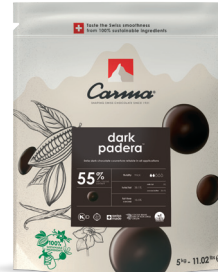
CARMA® Dark Padera 55% 5 kg • CHD-P002PADRE6-Z72