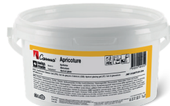
CARMA® Apricature 2.5 kg • JWF-013APTUR-Z54